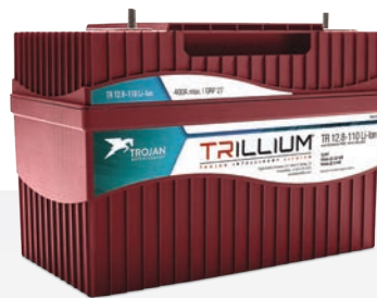
TR 12.8-110 LI-ION

Microprocessor Cell Balancing CAN Communications Amp-Hour Life Tracking SOC Gauge Battery Management System