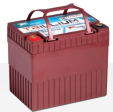
TR 25.6-25 LI-ION

Microprocessor Amp-Hour Life Tracking SOC Gauge Battery Management System Cell Balancing