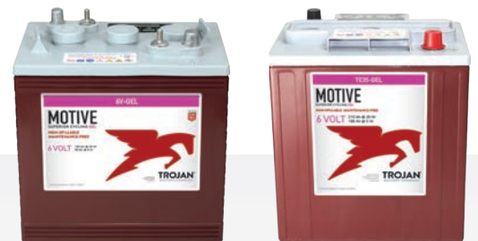
MOTIVE 6-VOLT GEL