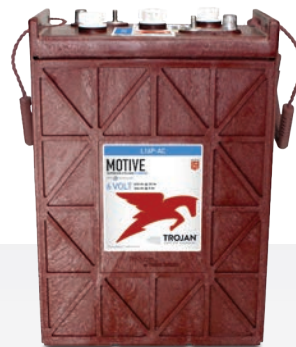
RUGGED MOTIVE 6-VOLT