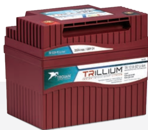
TR 12.8-92 LI-ION

Trillium gives you more runtime and longer life than other batteries in its class and delivers consistent power across the state of charge range. It's 20% smaller than competitors' batteries, can be charged in less than two hours, and is scalable up to 48 volts.