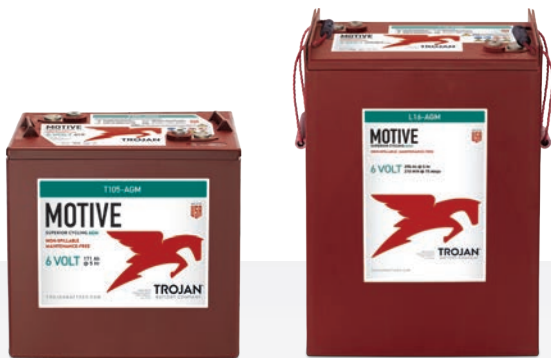
MOTIVE 6-VOLT AGM